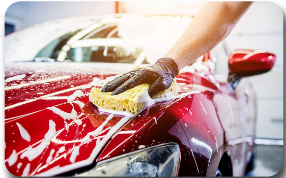
Car Washing Services