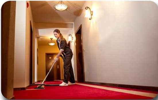
Public Area Attendant